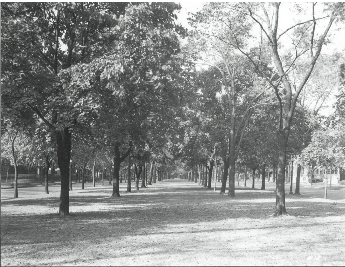
The bridle path in Humboldt Parkway at Girard in 1935.