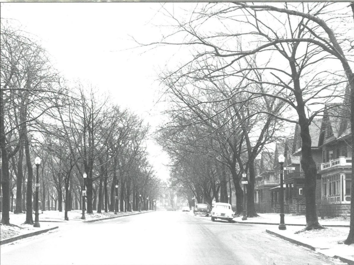
Humboldt Parkway at Riley Street looking toward the Science Museum in 1954.