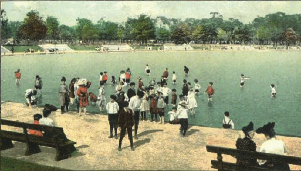
The enjoyment of a summer day in 1906 in the wading pond of Humboldt Park.