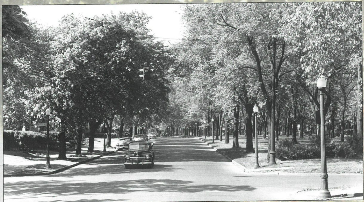
A summer drive along Humboldt Parkway at Northland in 1953.

Herewith are glimpses of Humboldt's former pastoral glory along with the signs of the six-lane intrusion that dead-ended nearly a century of the original Olmsted oasis.