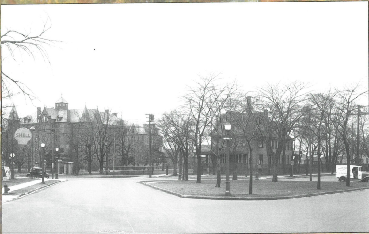
Humboldt Parkway at Kensington and Main, 1935. The Shell gas station at left was replaced by Robert Hall Clothes in the 1950s. Mount St. Joseph's building with cupola was demolished in the mid-1960s.