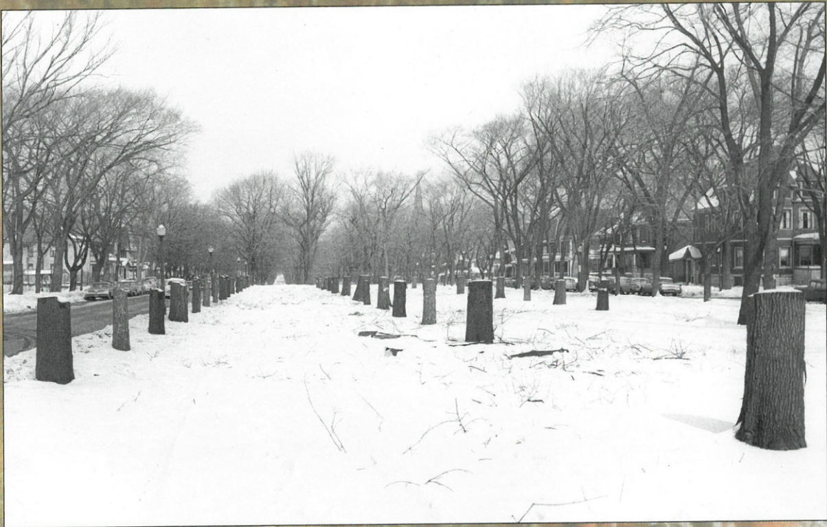
"Rows of tree stumps stand as forlorn reminders of the once picturesque center mall on Humboldt Parkway near Kingsley – they're coming down in the name of progress to make way for (the) Kensington Expressway..." reported the Courier-Express on March 3, 1960.