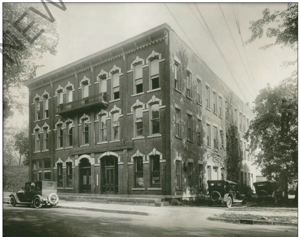
The Robert H. Newell & Company, Inc., ca. 1924, manufactured custom-tailored shirts for 86 years. What appears to be an early-1920s Cole Aero-Eight Sport Sedan in the lower left, identified by its unique octagonal rear and rear quarter windows, helped date the photo.